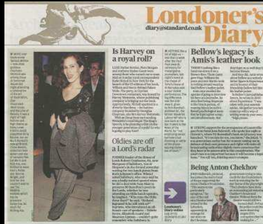
Evening Standard 10th November 2010 600,000 readers