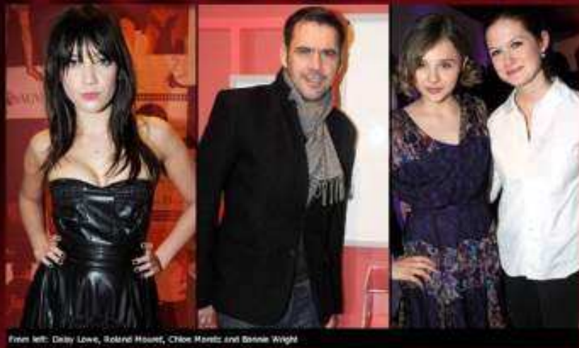
From left: Daisy Lowe, Roland Mouret, Chloe Moretz and Bonnie Wright