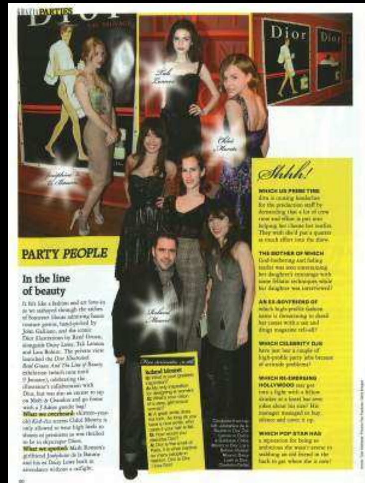
Grazia 29 th November 2010 227,000 readers