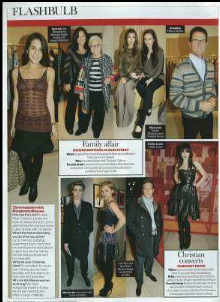
ES Magazine 19 th November 2010 600,000 readers