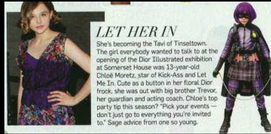
Sunday Times Style 21st November 2010 1,356,000 readers