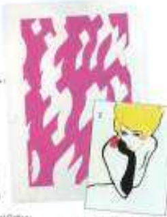
She illustrated here (above) and the Life of Beauty at Somerset House, London, November 18 to January 5. Call 020 7847 4900. Remembrance at the National Gallery at the National Gallery, London, November 20 to 22 May. Call 020 7747 2888. www.nationalgallery.org.uk

Here Graeco-Roman, classical and genre defining illustrations for artists like Giotto and Raphael house the artist's his admirably elegant line drawings of perfume bottles, couture dresses of all eras alongside work by contemporary fashion illustrators, showing the continued influence. At the National Gallery an exhibition by Bridget Riley includes several new pieces painted onto the walls their spaces in a great dialogue with the gallery's permanent collection. It's a fun and original way to explore the genre and inspiration behind Op Art and abstraction.