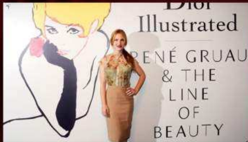
Josephine de la Baume

During the course of the evening we caught up with renowned designer Roland Mouret and French actress (and girlfriend of Mark Ronson) Josephine de la Baume.